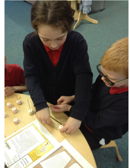
We were challenged to make the tallest spaghetti tower!