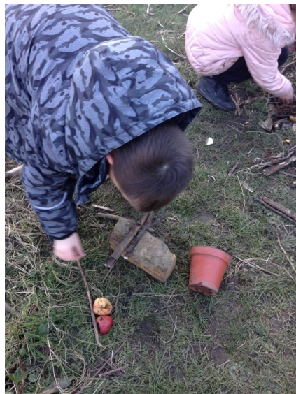
We explored the garden—finding different natural resources to make a bug hotel with.