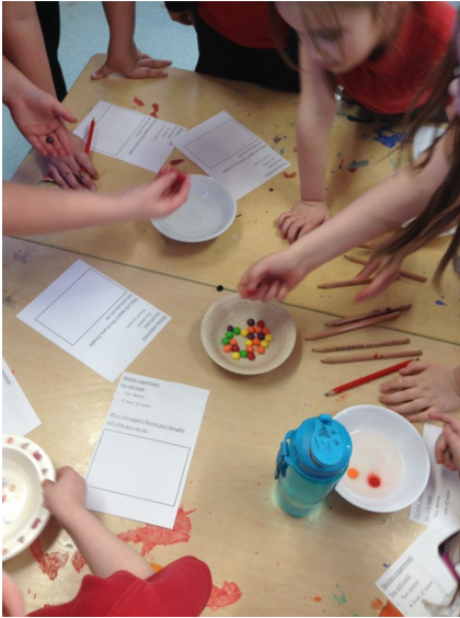
A colour mixing experiment.