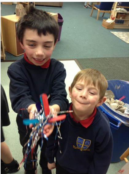
Making erupting volcanoes..